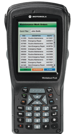
Workabout Pro 4 Short Shown with Numeric keypad.

(Workabout Pro 4 Long is shown on the front page with the Alphanumeric keypad.)